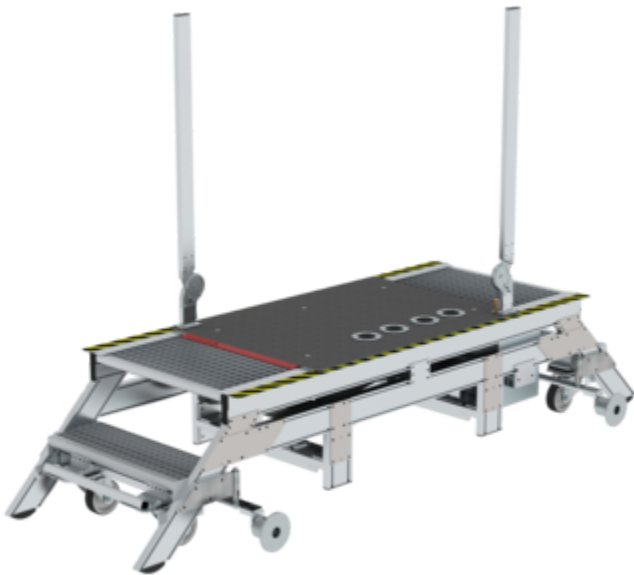
Order no.: 331026 Maintenance platform for track pits